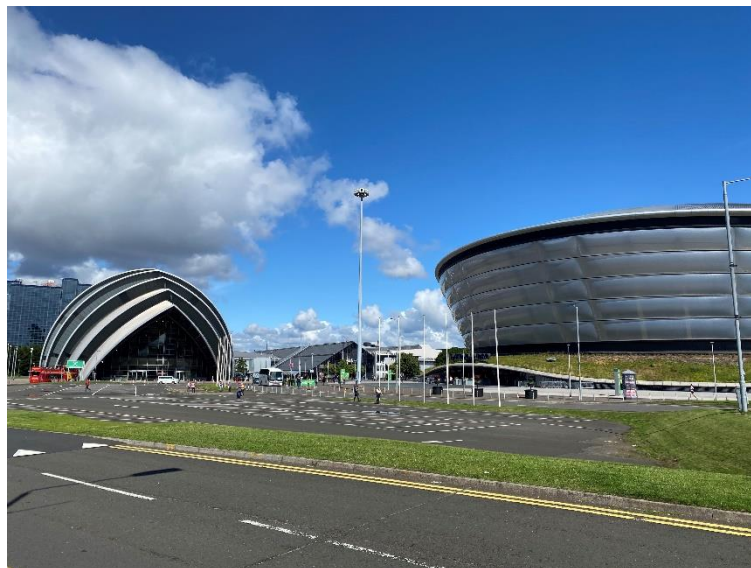
Venue- Scottish event campus

to express my gratitude to the Japan NMR Society for their generous support through the Young Research Travel Grant. This support played a crucial role in enabling me to attend and participate in such a fruitful and enriching event.